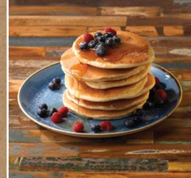
OVAL COUPE PLATE SCFSOP7 1 19.2cm 734" CTN QTY 12

DEEP SQUARE PLATE SCFSDS101 26.8cm 101/2" CTN QTY 6